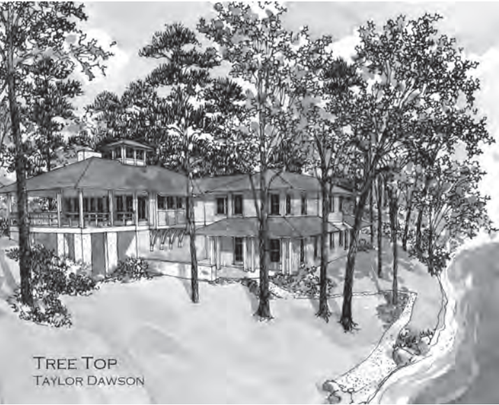
TREE TOP TAYLOR DAWSON